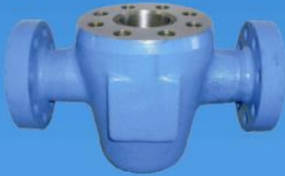
Valve Body 1-13/16" 10M