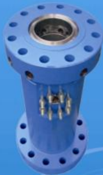
Tubing head 11" 5MX7-1/16" 10M