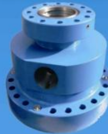
Spool 21-1/4" 5MX11" 5M