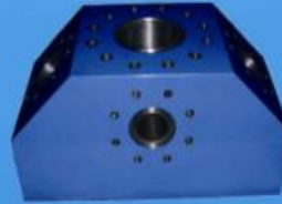
Y-Spool 7-1/16" 10MX4-1/16" 10M

INSPECTION AND TESTING EQUIPMENTS: DUROMETER (Brinell & Rockwell) Brinell Hardness Measurement System GAGEMARKER KING 3K (Brinell) Cameron Ball Gage