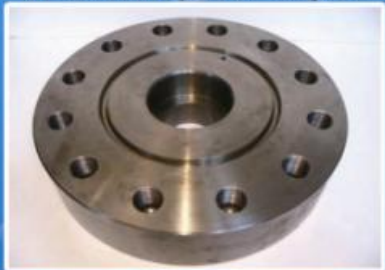
A4-EN Tubing head Adapter